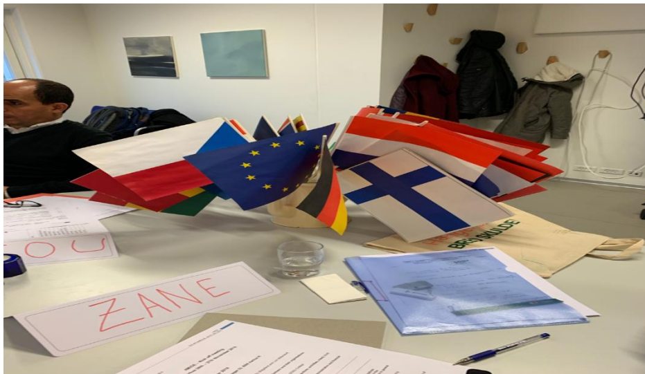
Meeting in Aarhus (DK), 27.11.2019.

The overall objective if project is to contribute to the improvement pf competences among teachers and trainers, who are educating and training basic care staff and to the improvement of competences among professional caregivers with regard to multi-ethnicity / multi-culturality and dementia.